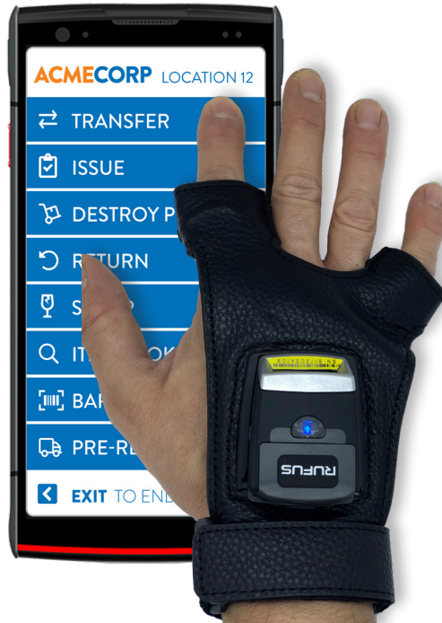
StayLinked and RUFUS take traditional terminal emulation to new heights with touch-enabled applications and hands-free scanning capabilities.

By introducing new intelligence to the terminal emulation process on the host system, the emulation screens can be intercepted before they are sent to the wireless device, and the elements of the green screen can be overwritten by a rich graphic interface that is familiar and easy-to-use to the mobile user.